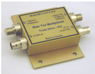
MT25/40 - Bias Tee Multiplexer