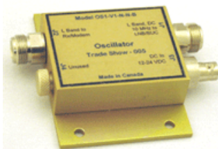
MOS - 10 MHz Master Oscillator